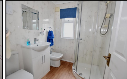
Pitch Fee: approx £215.52 per calendar month Subject to Annual Review Council Tax Band: 'A' Tenure: 1983 Mobile Homes Act Agreement